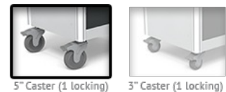
5" Caster (1 locking)